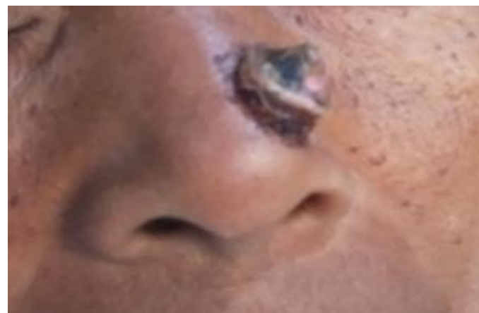
Figure 1: Growth on left nasal dorsum.