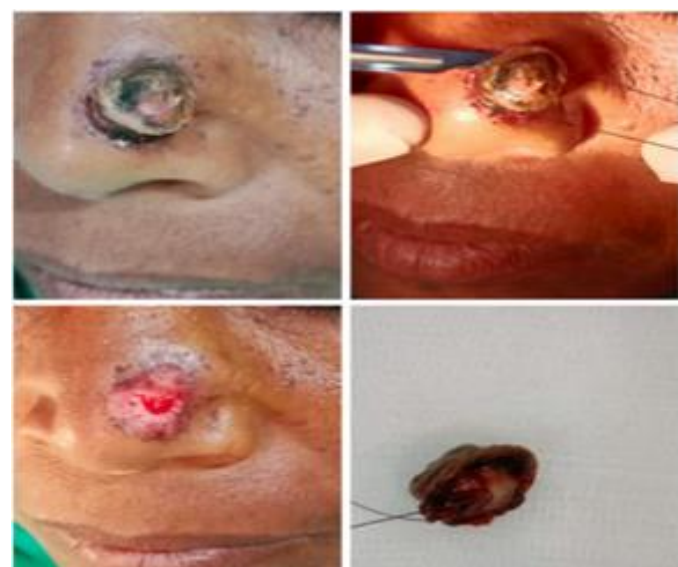
Figure 2: Excisional biopsy done and specimen sent for histopathological evaluation