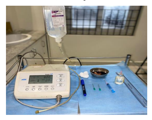
Figure 1: Depicts the materials required for irrigation arthrocentesis of TMJ disorder

For performing the procedure, two-21-gauge needle, Local anaesthetic agent, 2 ml syringe, Ruler, Marker, Physiodispenser, kidney tray ,20 ml syringe,100ml NS (normal saline) are required.