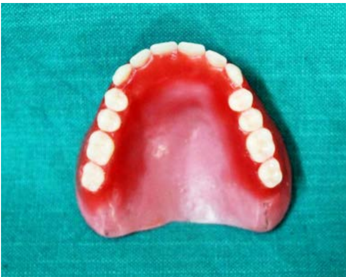
Fig 3: Palatal wax removed