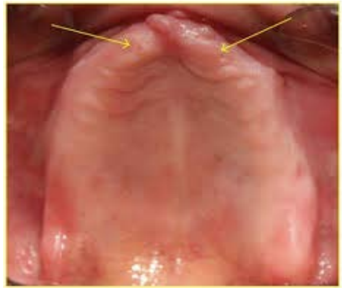
Fig 1a: Edentulous Maxillary Ridge