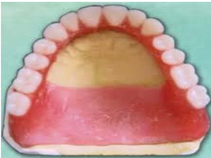
Fig 4: Putty adapted over central area to form the reservoir