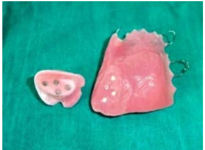
Fig 5: Lid and the denture cured separately