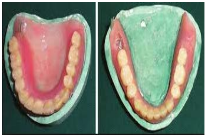
Fig 6: Lid permanently attached with autopolymerizing acrylic resin