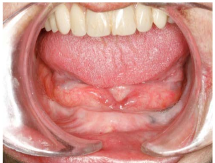
Fig 1b: Edentulous Mandibular Ridge